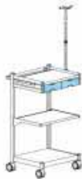
AX MUC - 5