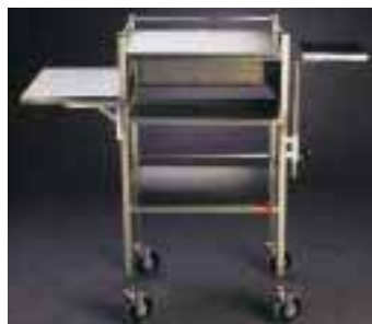
AX 099 Computer Trolley 600 x 490 x 1080 Stainless steel construction Pull out keyboard shelf Mouse holder 100mm castors - 2 with brake