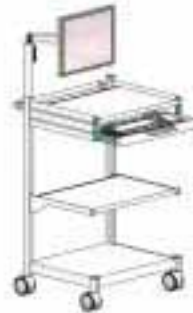
AX MUC - 6