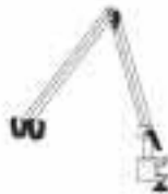
AX 80730 Articulation Arm