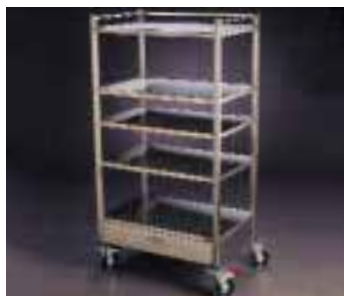
AX 081 Video Equipment Trolley 750 x 490 x 1100 Stainless steel construction 5 x Shelves 1 x Drawer 125mm deep 125mm castors - 2 with brake