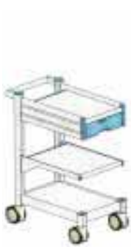
AX MUC - 1